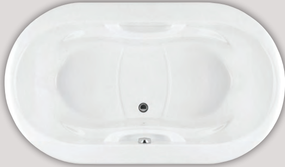
AMMA OVAL 7242